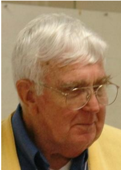
Virginia Master Naturalist, Northern Neck Chapter (2016) Pastor, Wicomico Baptist Church