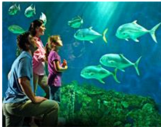
Aquarium at Virginia Living Museum, Newport News, VA

concurrent sessions on Sunday - for a total of six possible trainings! There will also be opportunities for field trips on both Saturday and Sunday as well as pre-conference field trips on Friday.