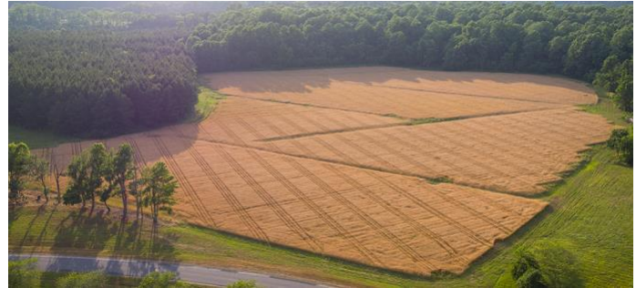
Grapewood Farm, Montross, VA

The Northern Neck News reported this story on May 10, 2022