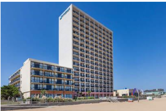
The Wyndham Virginia Beach Oceanfront will be our home base for the 2022 VMN Conference

http://www.virginiamasternaturalist.org/vmn-statewide-conference.html