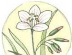
Master Naturalist 2113 Recertification Pin

As of October 31, only twelve members have recorded sufficient hours for recertification, 40 hours of volunteer time and 8 of advanced training. It is important to add all of your hours and check them by December 15 because the yearly report goes to state on or around