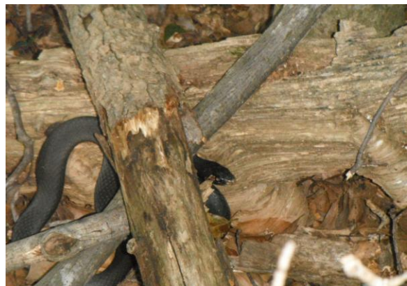
Menokin Fauna, Eastern Rat Snake

Menokin Flora/Fauna Survey. The Menokin Flora and Fauna Survey is an informal survey that will be used to aid the Menokin Foundation in securing permits for two soft water access landing canoe/kayak sites and one view shed.