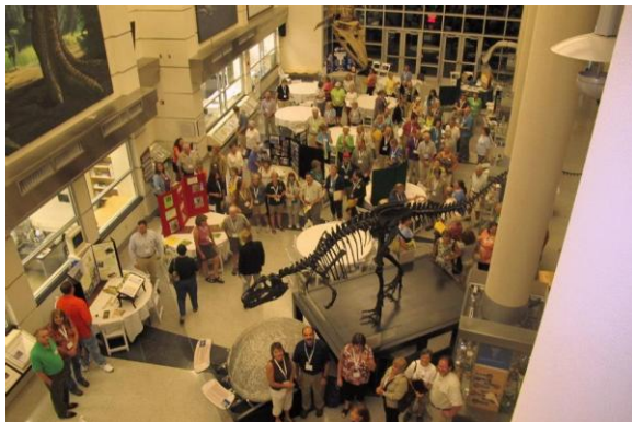
VAMN Conference Attendees

The Virginia Master Naturalist Statewide Volunteer Conference and Training was held at the Virginia Museum of Natural History in Martinsville and Fairy Stone State Park in Stuart September 7-9, 2012. Five Northern Neck Master Naturalists attended the conference.