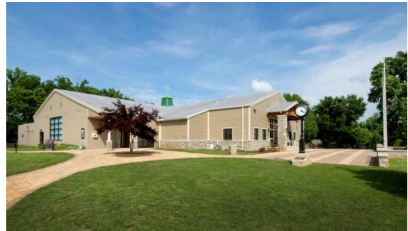
Smith Central Activities Building, Skelton 4H Center

Early registration will open June 20 . Lodging will be available at the conference center. For more information go to www.regonline.com/vmn2016conference where details will be posted as they become available.