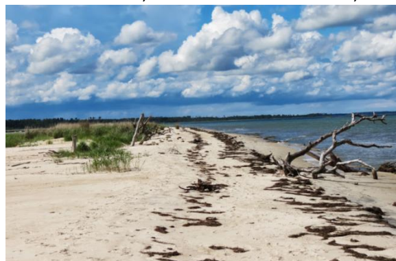
Hughlett Point North Beach Trail .

The Wetlands Project is looking for volunteers to work on expanding its new Wetlands Adventure Trail program. They have received funding to create the template/web platform and have completed the first four Northern Neck sites, the Natural Area Preserves. Now they would like to add Belle Isle SP, Westmoreland SP, GW National Monument,