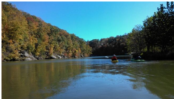
Smith Mountain Lake at W.E. Skelton 4H Center

The 2016 Virginia Master Naturalist Statewide Volunteer Conference and Training will be held Friday, August 26, through Sunday, August 28, 2016 at the Skelton 4-H Educational Conference Center in Wirtz, Virginia.