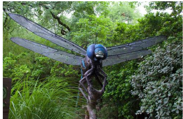
Robotic Blue-eyed Darner Dragon Fly.

Six people (two NNMN, two husbands, and two members of the new class) traveled to Newport